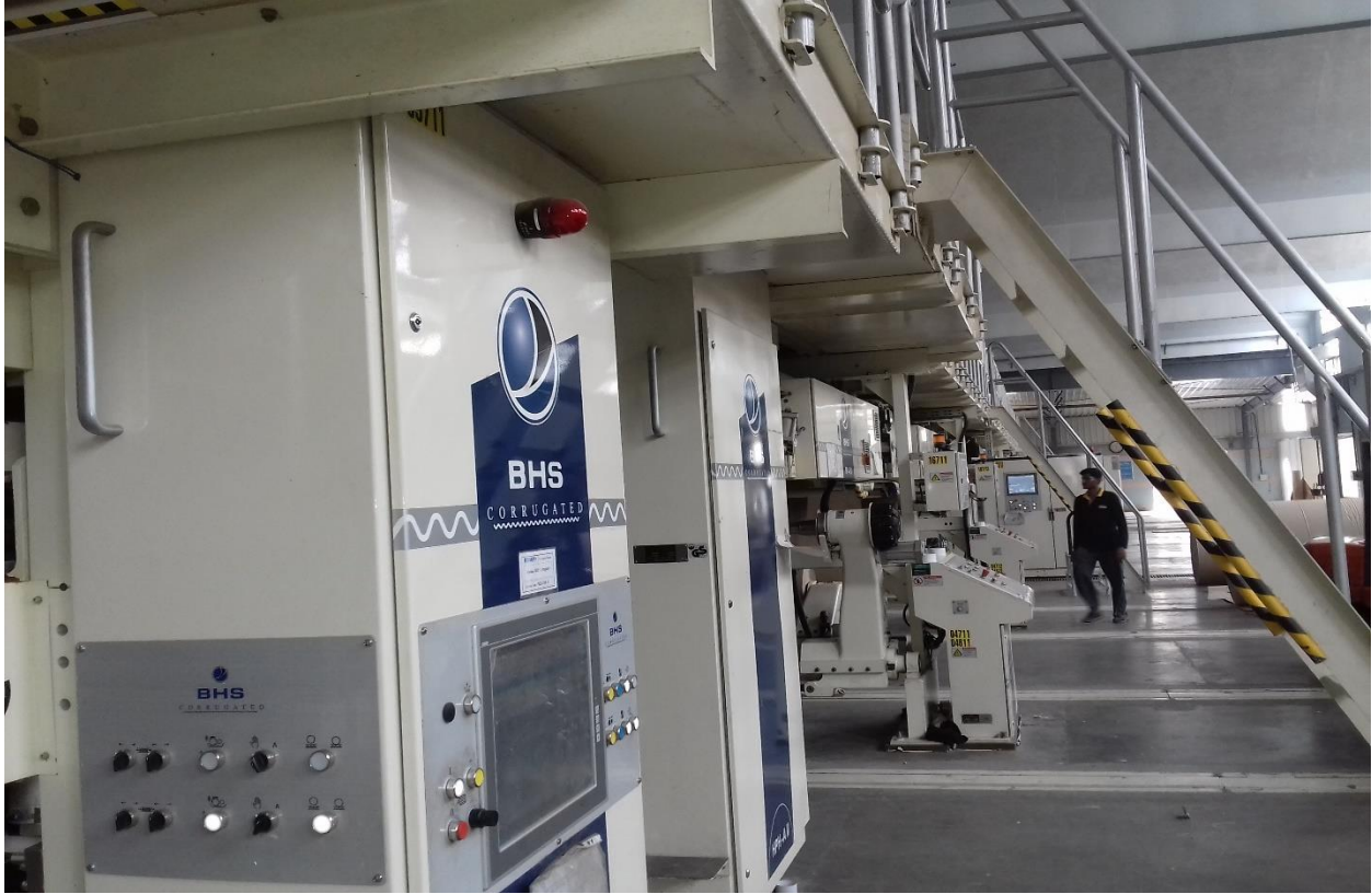
Civil Work – Corrugation Extension