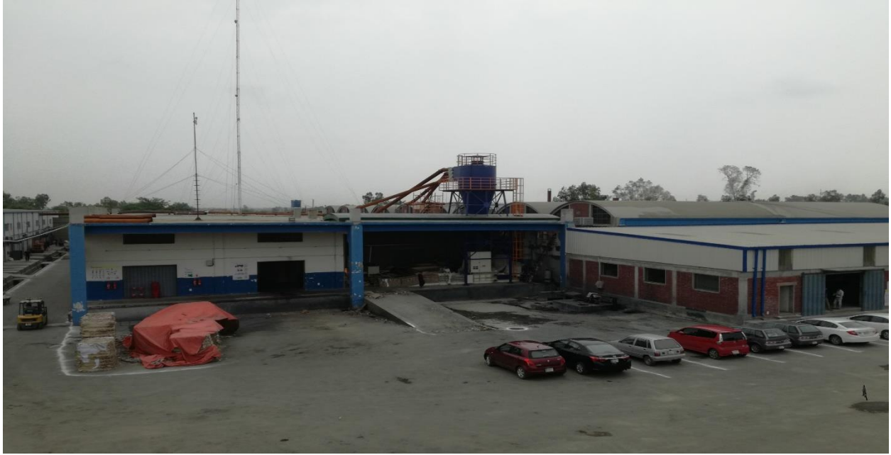
Utilities – Corrugation