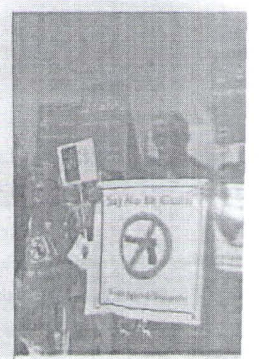
KARACHI: Campaigners of the 'Walk a Cause' protest on Sun

28 NOV 2016 NEXT CAPITAL LIMITED 8th Floor, Horizon Tower, Plot No. 2/6, Block-III, Clifton, Karachi UAN: 021-111-639-825