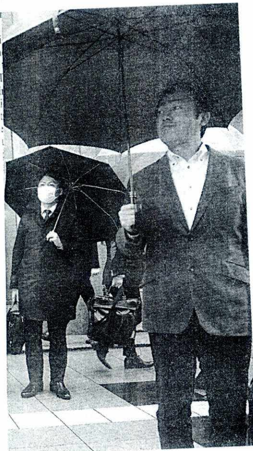
Monday. Asian stocks were mixed after Beijing cut markets in mainland China rising while Hong Kong's

There's an interesting comparison. For years, BlackBerry had a lock on the business world because it claimed its devices were more secure than Apple's iPhones. But it proved only a matter of time before corporate procurement departments