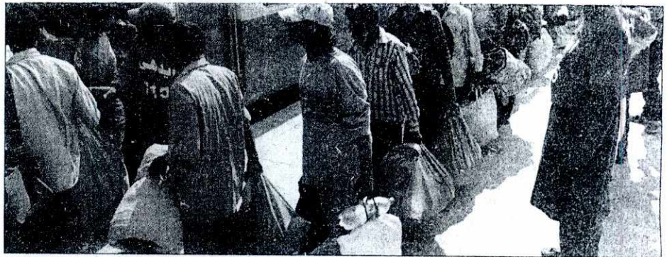
KARACHI: Indian fishermen leaving for Wagah border after their release from Malir Jail, here on Monday.

Minister of State and Chairman Board of Investment Dr Miftah Ismail inaugurated the complex. A number of notable dignitaries attended the event including a delegation of over 13 members from Sumitomo Corporation and JFE steel Japan. Other notables included the Counsel Generals of Japan and Germany.—PR